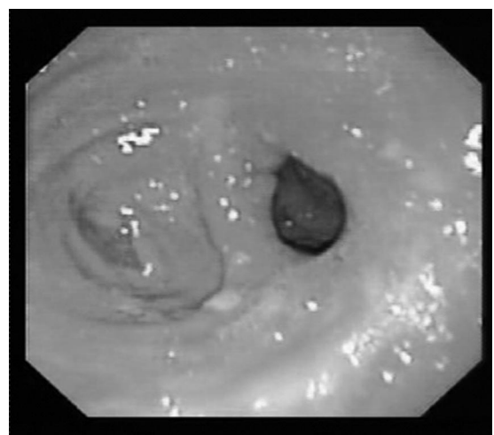
Figure 1. Preoperative endoscopic photograph of the gastrojejunostomy.

Forty-two patients (66%) underwent the procedure due to severe dumping syndrome. Symptoms were improved in all patients and completely relieved in 30 patients (71%). Fifteen patients had severe reflux resulting from a patulous gastrojejunal anastomosis. GERD symptoms were improved in 80% of patients and completely relieved in 20%.